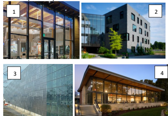
1. Oregon Zoo Education Center- zero collisions since installation in 2017. 2. Swathmore College, PA - one collision since installation in 2017. 3. Javits Center in NY- 90% reduction in collisions since installation in 2013. 4. National Aviary, PA- zero collisions since installation in 2020.

Bird-Friendly glazing can reduce the number of birds colliding with the building, as documented in many examples.